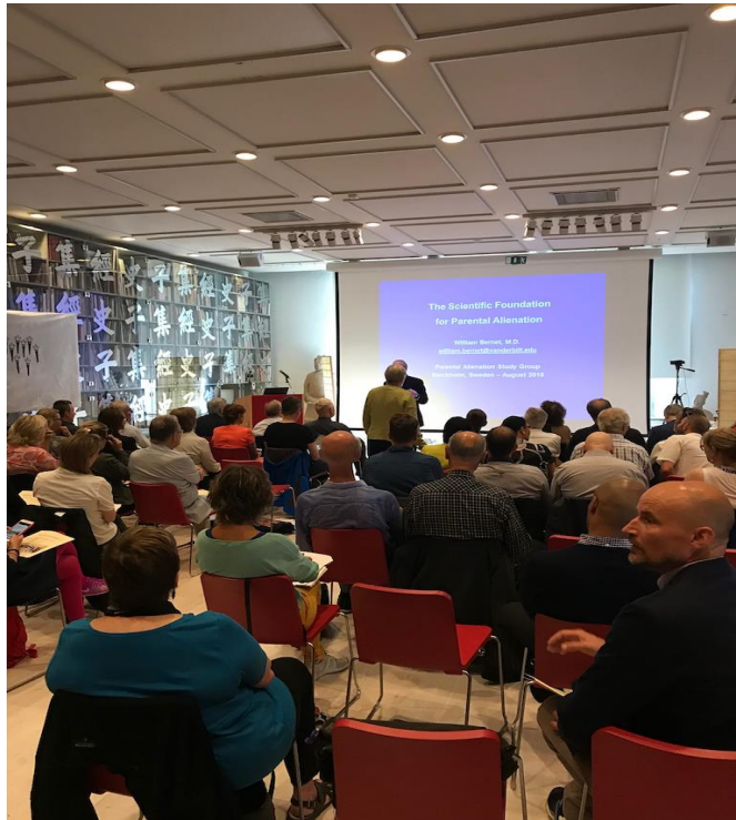
Attendees at the first day of the conference, held in The Museum of Far Eastern Antiquities, Stockholm.