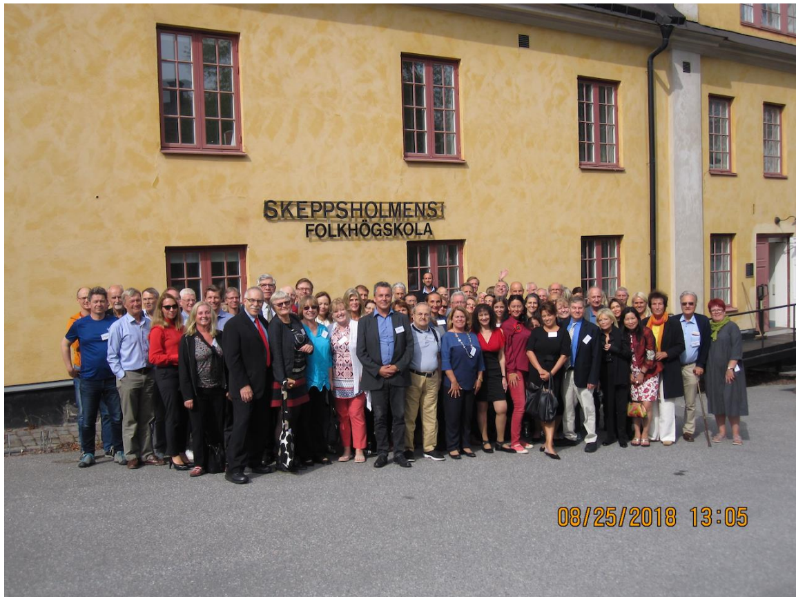
Participants outside the conference venue on the second day of the PASG conference.

STOCKHOLM, SWEDEN hosted a vibrant gathering of parental alienation experts at the Second International Conference of the Parental Alienation Study Group. The two-day conference, August 24-25, included presentations and discussions from the top authorities in parental alienation. There were 20 presenters and panelists from 12 countries. Some 80 people attended the conference, with more than 30 other attendees viewing the event via video streaming.